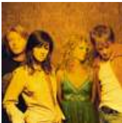
Little Big Town

Porter TV Furniture and Appliance and the Tallahatchie RiverFest have come together to give one lucky winner the "Best Seats In The House" for the Little Big Town concert on Saturday, September 23 at 8:00 p.m. during the Tallahatchie RiverFest.