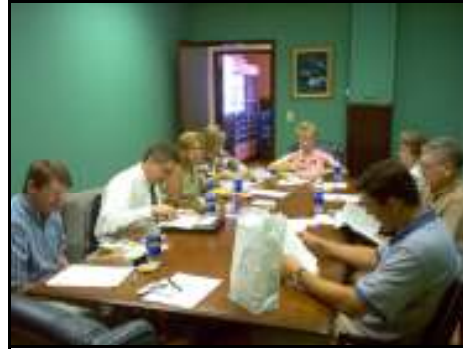
PHOTO to the RIGHT: Some of the members of the UCDA Ambassadors Club gather at the UCDA office to learn

The UCDA Ambassador's Club began this year. The club is designed to help promote UCDA, retain membership, and to help improve the experience for each and every partner of the Union County Development Association.