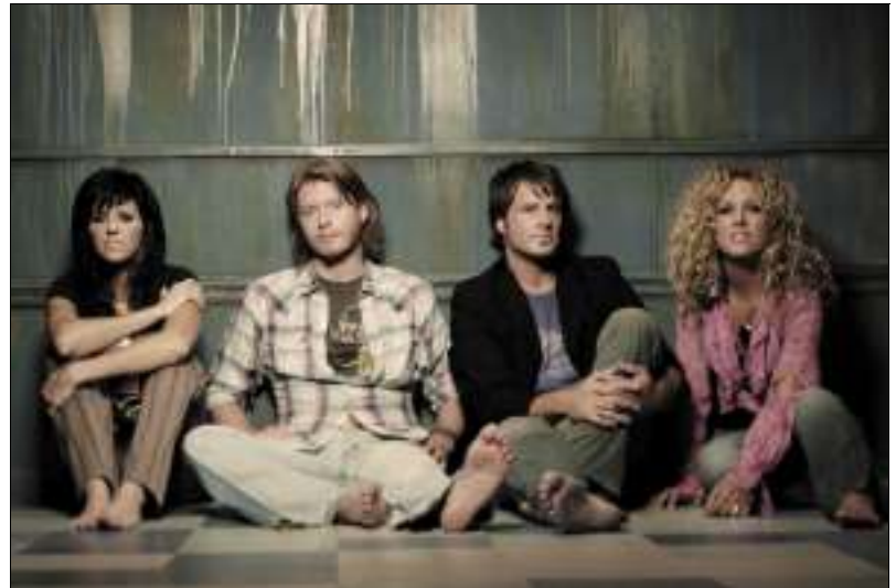
Little Big Town

The group has toured with country favorites Keith Urban and Kenney Chesney. They have also opened for music legend John Mellancamp. In addition, their latest album The Road to Here was recently certified Gold by the Recording Industry Association of America.